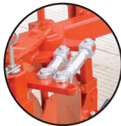
With Side-Link Angular Adjustment